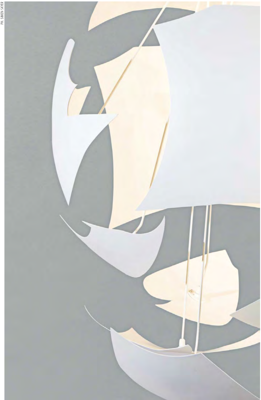
PH. SIMEN SKYER

Wherever placed, Scheisse will hopefully stand out as a true icon for all light lovers.